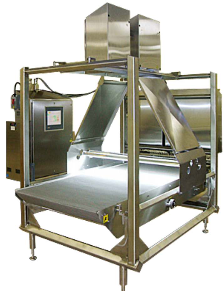
MT-42 Series In-line Vision Inspection System for Donuts